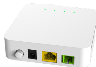
Patch installation (f2140-00)