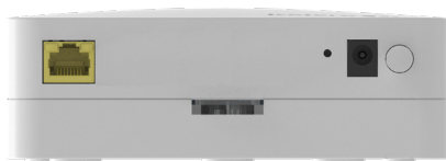
FTU installation (f2141-00)

The Baldur GPON ONT has a variant with the fibre termination unit (FTU) that supports all types of fibre installation methodologies.