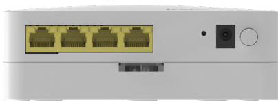
FTU installation (fX411-00)

The f-series ONT comes with the fiber termination unit (FTU) that supports all types of fiber installation methodologies and facilitates the use of single or dual-fiber in cable and tube. It is BBF.247 compliant, ensuring interoperability with OLT devices from Nokia, Adtran, Huawei, and others. Recognizing the complexity of ONU and OLT integrations, the process is simplified by providing easy access to MIB data in standard JSON format. Also, a special integration software that mirrors all PON traffic for support and troubleshooting is available. Furthermore, a special integration software enables SSH access on the LAN port for remote troubleshooting.